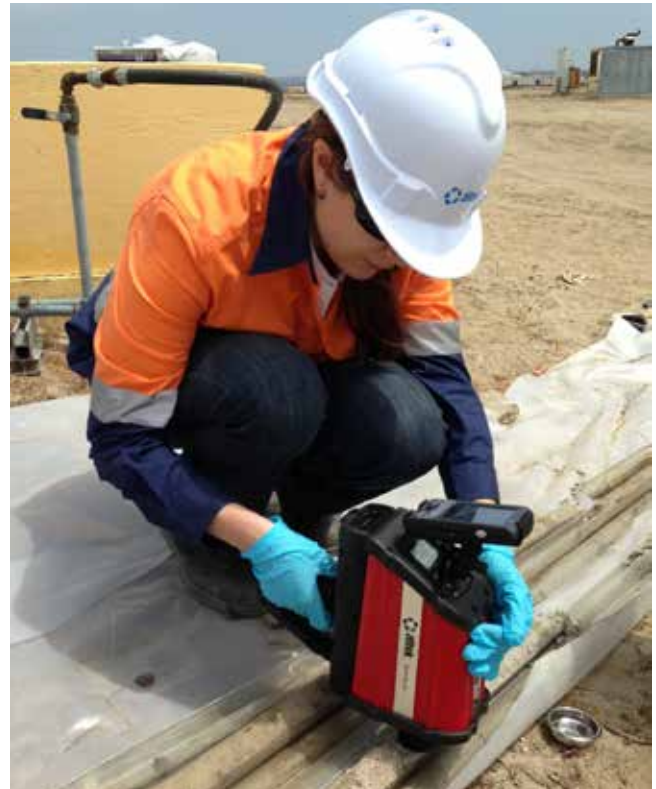
Figure 1: Using RemScan as a screening tool at the North Island test site

The RemScan predictions were compared to laboratory assay data (US EPA Method 8100 TPH) for each of the samples to determine the accuracy of the technology. Repeatability measurements were also carried out on selected samples. After two hours of formal training, Battelle staff were asked to comment on a number of usability claims and to fill out a usability questionnaire.